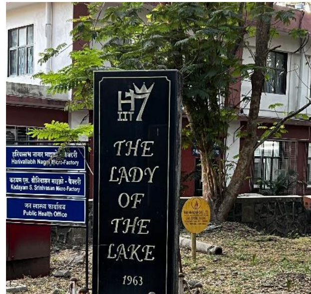
H7 has always been known as ' The Lady of the Lake ', every H7ite will recognize these images