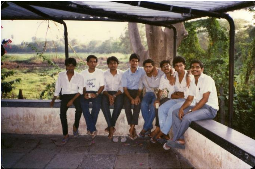
H7ites and a cack session in progress at H7's popular 'Marine Drive'